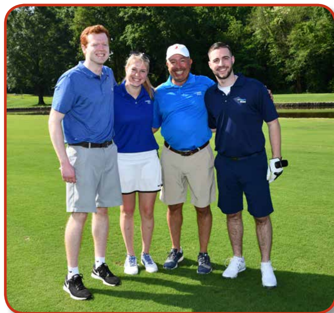
President's Flight Winners