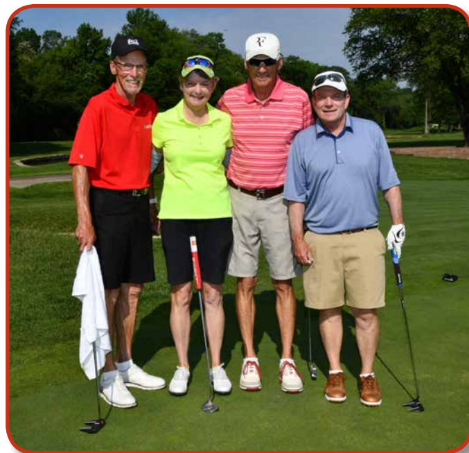
Commandant's Flight Winners

The Commandant's Flight (team low gross score) was won by the team representing Lindbergh Photography and the President's Flight (team handicap adjusted score) was won by the RSM Team.