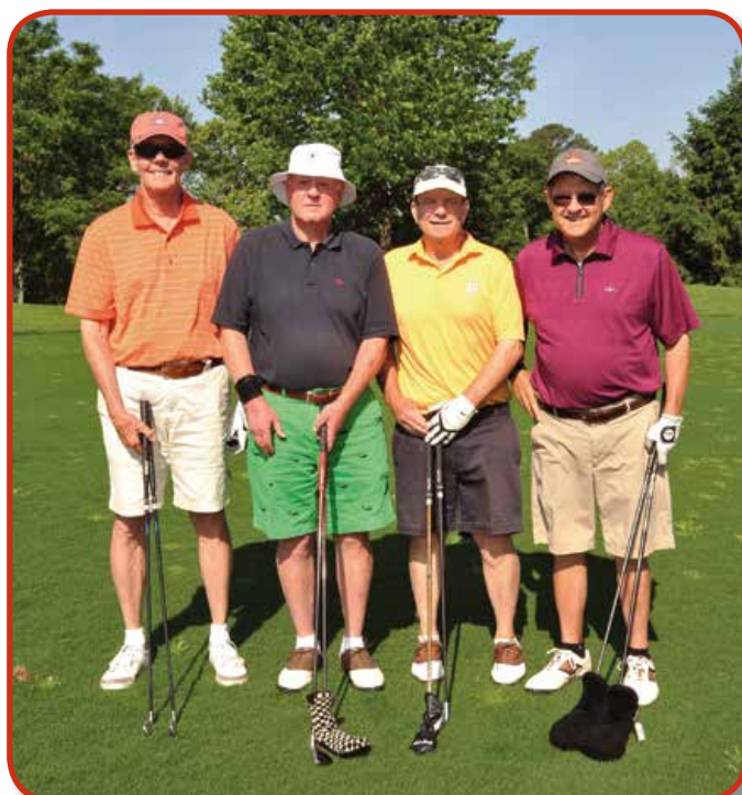
President's Flight Winners