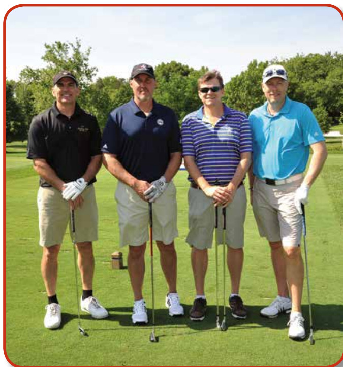
Commandant's Flight Winners