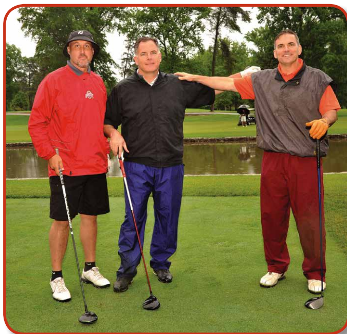
President's Flight Winners