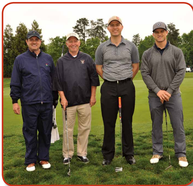
Commandant's Flight Winners

The Commandant's Flight (team low gross score) was won by the team from SY Group at Merrill Lynch and the President's Flight (team handicap adjusted score) was won by the Fleet Team.