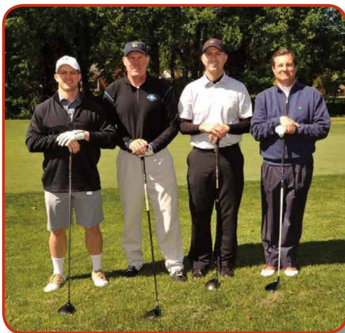
President's Flight Winners