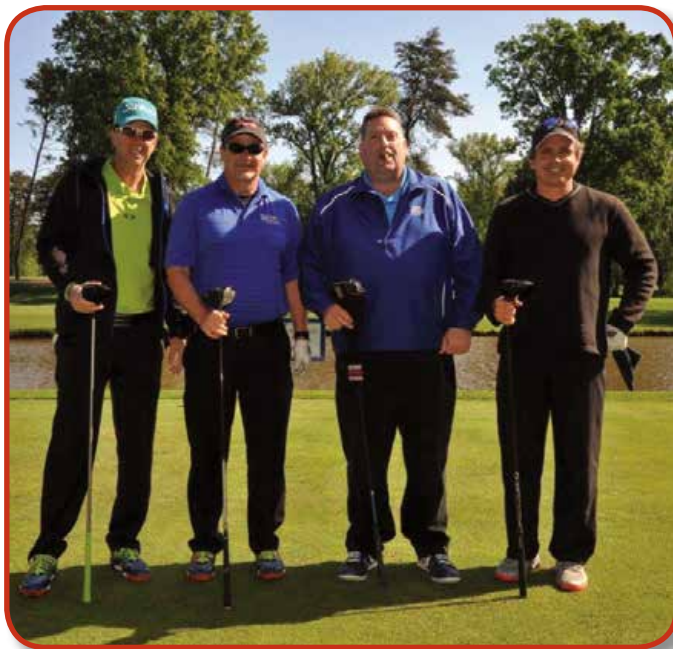
Commandant's Flight Winners

The Commandant's Flight (team low gross score) was won by the Communication in Action Team and the President's Flight (team handicap adjusted score) was won by the Bank of America/ Merrill Lynch Team.