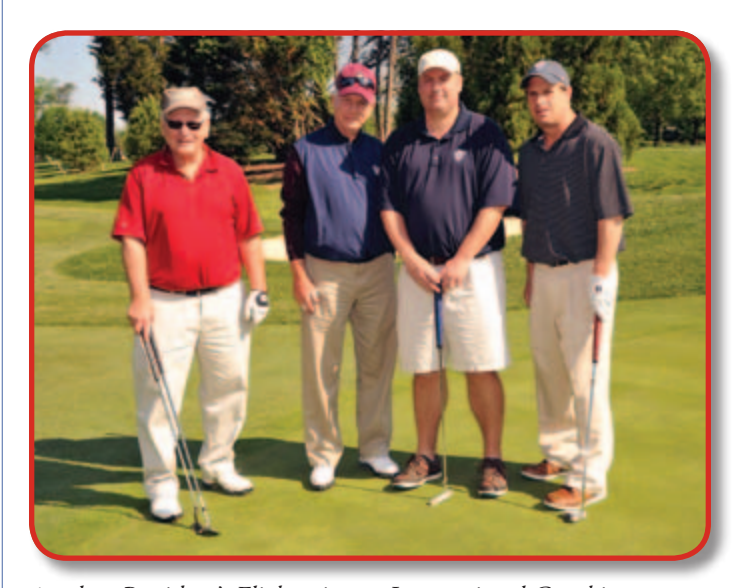
1st place President's Flight winners International Graphics