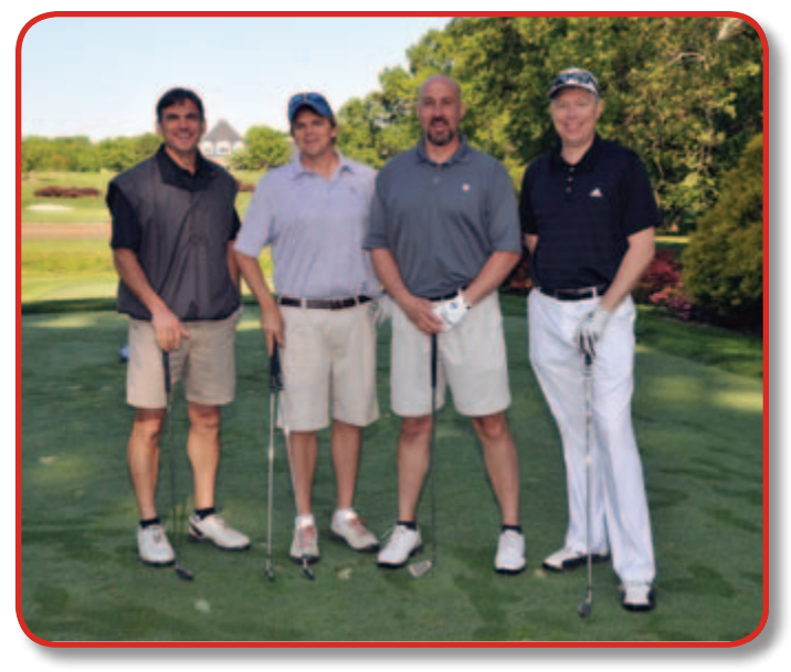
1st place Commandant's Flight winners 1st Degree